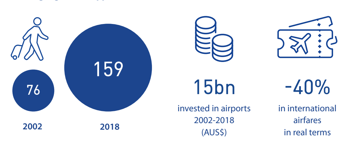
FIGURE 1 - PUBLIC BENEFITS OF THE MONITORING REGIME

The public benefits of these reforms are clear – since price controls were removed in 2002 every major Australian airport has negotiated multiple multi-year commercial agreements with airlines that led to the airport sector investing in excess of AUD15 billion between 2002 and 2018, two thirds of which has been in aeronautical assets, which facilitated national passenger growth from 76 million passengers per annum in 2002 to 159 million in 2018.<sup>2</sup> Service quality has been maintained or improved and investment in international capacity has stimulated airline competition that has led to a 40 per cent reduction in international airfares in real terms.<sup>3</sup>